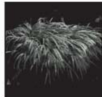
Hakonechloa macra 'Aureola' Golden Japanese Forest Grass

makes an outstanding bright accent in the lightly shaded garden. Growing slowly to 1' high and 3' wide, the elegantly arching blades are striped in brilliant green and gold tones. This exceptional ornamental grass performs best in a moist soil. Plants can be seen in the walled garden at Yew Dell Gardens. It is most at home in USDA cold hardiness zones 5-9.