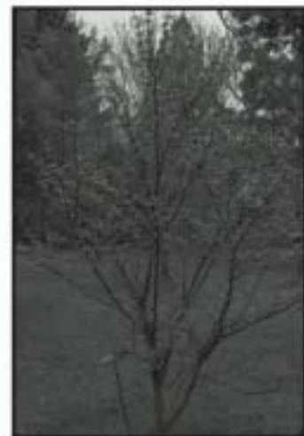
Cercis canadensis 'Appalachian Red'

is a stunning new selection of our native redbud. This 20-25' tall tree absolutely explodes with brilliant fuchsia pink flowers in Spring; a much brighter shade than the typical redbud. Most at home in sun to dappled shade, 'Appalachian Red' will adapt to any average garden soil. Specimens can be seen at Yew Dell Gardens, Seneca Park, Bowman Airfield, and Whitehall House and Gardens. Best in USDA cold hardiness zones 5-8.