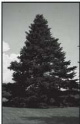
Abies nordmanniana Nordmann Fir

Promoting New and Superior Plants for Kentucky Landscapes