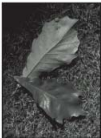
Quercus bicolor Swamp White Oak

is one of our most outstanding native oaks. Growing to 50-60' tall with an upright oval outline, it makes an excellent shade tree specimen and is also useful in street tree and parking lot plantings. This long-lived species is tremendously adaptable and once established, is tolerant of both wet and dry soils. Summer foliage is a dark glossy green with a bit of yellow in the Autumn. Louisville's Cave Hill Cemetery has some excellent specimens. It is best adapted to zones 4-9.